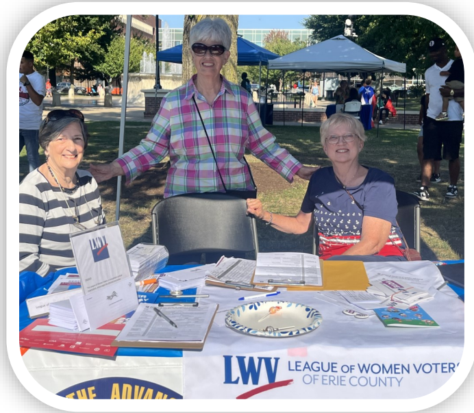
Several Branch members joined with the League of Women Voters of Erie County at a voter registration drive at the recent Spanish Heritage Festival at Perry Square.