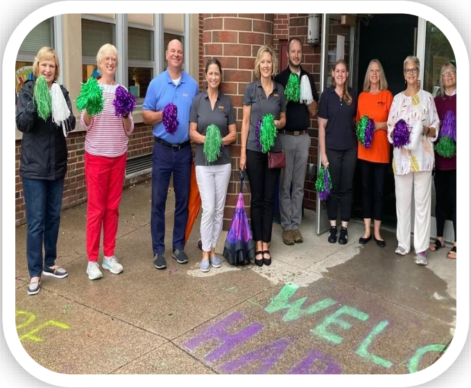
Members of Erie Branch helped welcome Harding Elementary School students back to school in September. The event is part of the United Way's Community Schools program.