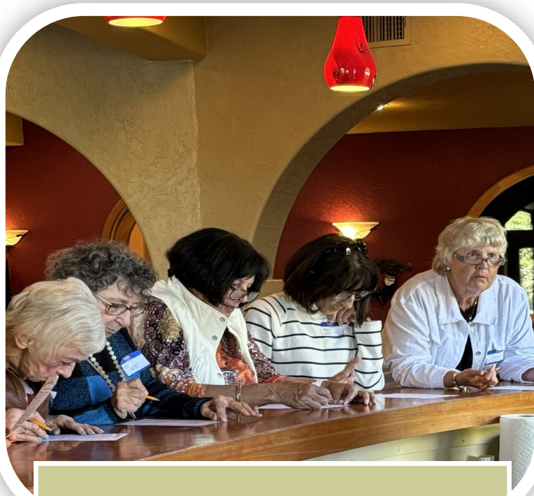
Branch members enjoyed a tour of Wine Country as part of the Food and Friends study group's October event.