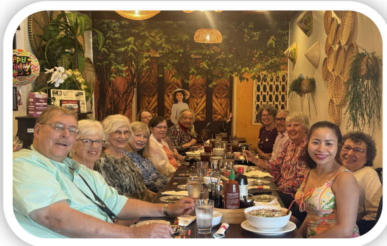
In September, Food and Friends study group sampled a variety of dishes at Saigon Nights before making their dinner selections.